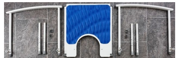
Figure 2 – Product Parts