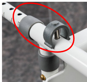
Figure 6 – Securing the leg extensions