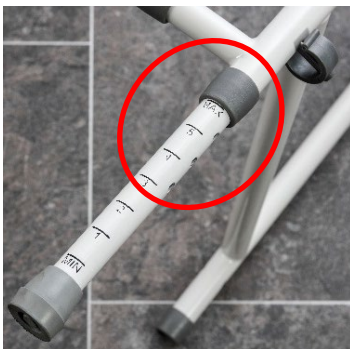
Figure 5 – Positioning the leg extensions

Place the frame around the toilet with the platform pushed back as close to the toilet as possible, figure 1.