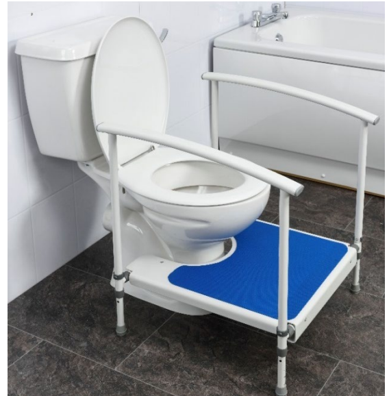
Figure 1 – Toilet Platform