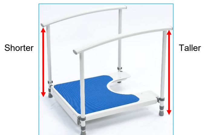
Figure 3 – Handle frame position